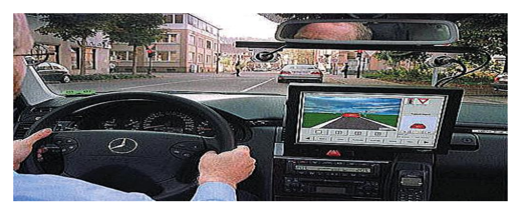
Figure 2: View of System